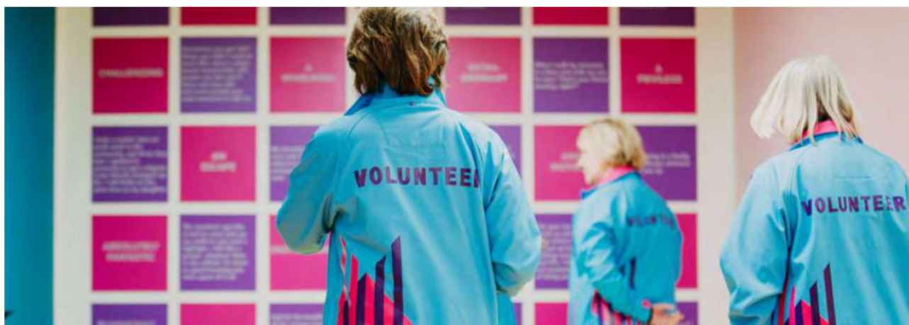
Volunteers at the launch of an exhibition at Humber Street Gallery