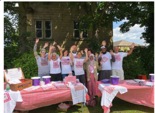
Volunteers at the More in Common initiative, Barley

*SOURCED FROM UK AND ABROAD, 2008 ONWARDS