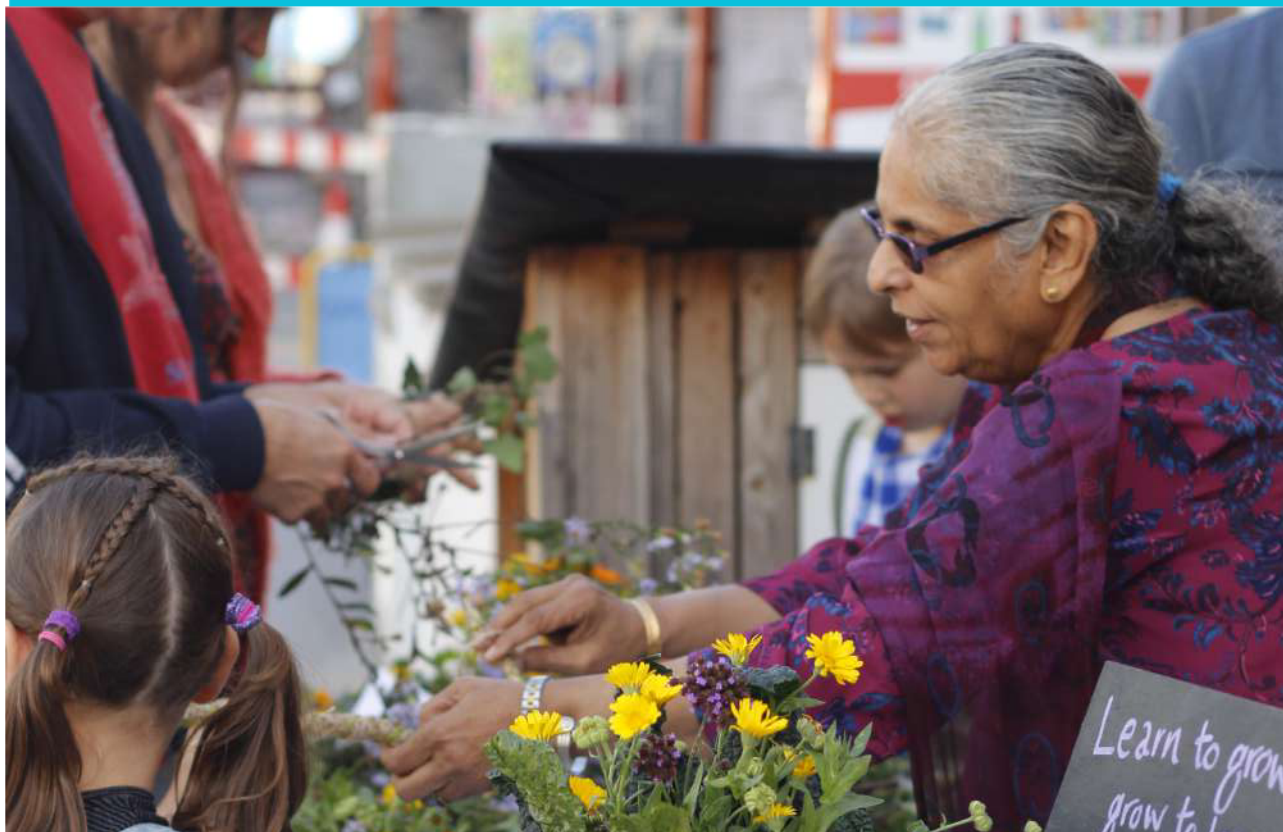
A volunteer at an Apple Day event, East London

We've gathered together further resources to help you in your efforts to promote wellbeing through volunteering. Look at our volunteering page for more information.